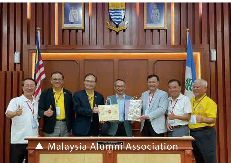
▲ Malaysia Alumni Association

NTPU's alumni associations span the globe, including chapters in the United States, Thailand, Hong Kong, Myanmar, Malaysia, Australia, Macau, and Vietnam. These associations foster strong bonds among alumni across continents and serve as an important platform for overseas graduates to stay connected with—and continue supporting—their alma mater.