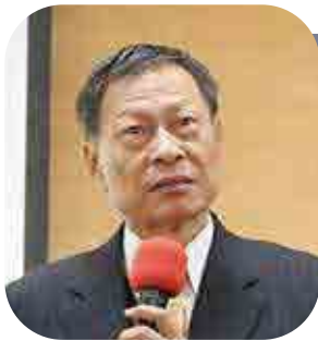
Lai, Ing-Jaw Minister, The Judicial Yuan Chief Justice of the Constitutional Court