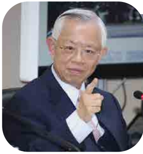
Perng, Fai-Nan Governor The Central Bank of Taiwan