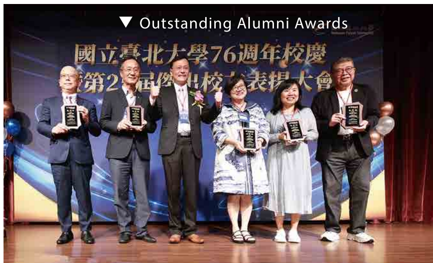
▼ Outstanding Alumni Awards